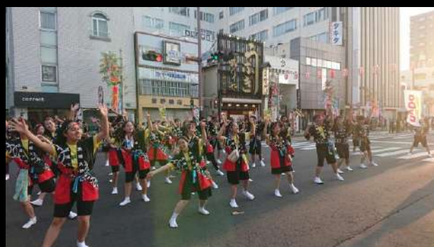
Mito Komon Festival, Summer 2019

After the video is uploaded on YouTube with the "limited Access," it will be posted on the website of the "Remote Mito Komon Festival."